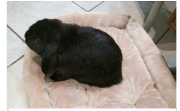
Georgie road testing his new velvet bed in the packing room.

If you are interested in breeding with our sweet little man, please call us on 08 8363 7733.